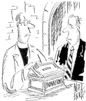
"It comes to something when the state of the pound is such that we hope to find lots of foreign coins!"

A New York traffic expert says that some London taxi drivers are refreshingly different - and witty - compared to those in New York. He tells the story of the London taxi driver who screeched to a halt when a tourist bolted into the road, and then stopped, looking around in confusion. Leaning out of the window the taxi driver asked very politely: "I say, sir, may I ask, what are your immediate plans?"